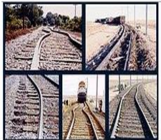
Figure 1: Example Related to Distortion Induced at Thermal Weight Considering Rails

Different scientific methods have been proposed for the analysis of thermal stresses in reinforced substantial edge structures. As a rule, these methodology endeavor to represent diminished part solidness while determining the second dispersions that emerge from the restrained misshapenings of edges under thermal burdens. Nonetheless, these techniques will quite often be convoluted or depend vigorously on simplifying presumptions. Likewise, a portion of these techniques may not consider significant factors like cement elasticity, strain stiffening subsequent to cracking, all the while acting mechanical burdens, power rearrangement, nonlinear thermal inclinations or non-consistently broke individuals all the earmarks of being the appropriate choice.