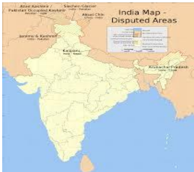
Figure 2: Sino Tibetan Issues

The Tibetan issue was another most significant aggravation in the Sin-Indian relations. Thus, during the 1950s India's relations with China started to get stressed not with the Boundary dispute yet with the development of Tibetan Issue. To be sure, the limit dispute among India and China arrived at a peak when India got thoughtful towards the Tibetan issue of self-sufficiency in the mid-1950s. This was not cherished by the Chinese government, which named India's position as impedance in China's inward issues. In this manner, the Tibetan issue added fuel to the effectively disturbed limit issue between the two countries. Truth be told, China considered Tibetan issue as more significant than the limit issue while improving relations with India, however it was a central issue between the two countries.