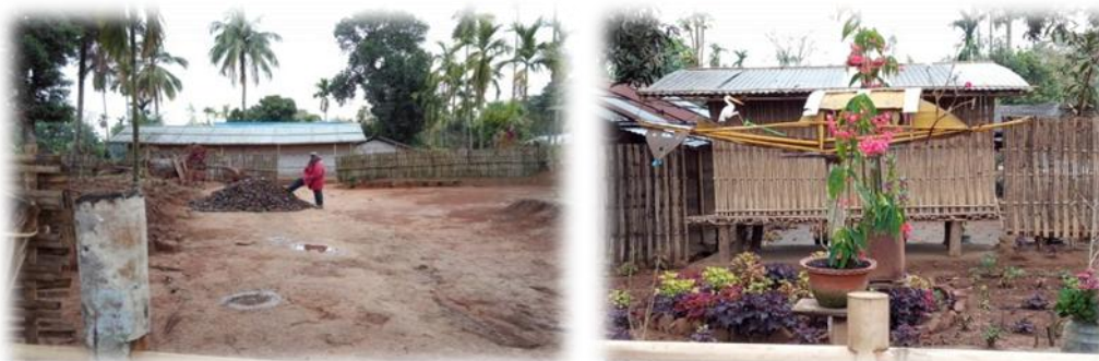
Plate: Beautification of the village by planting colourful plans.

given utmost emphasis to the provision of proper sanitation facilities in rural areas. In 2016-17, 10.54 lakh individual household toilets were built in the State and many more individual and community toilets are under-construction. In order to spread the message of cleanliness, the Government also institutionalized the "Cleanest Village Award" which went to Rangsapara village in Goalpara district. Government of Assam is continuously working hard to improve the level of cleanliness throughout the length and breadth of the State. However, change can come only when all of us work together and bring about positive changes in our State. Support us in this endeavor and let us transform Assam into a cleaner and better one.