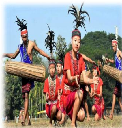
Plate: People Performs During Wangla Festivals

Wangala dancing has gained prominence as an important cultural expression of the Northeast Indian Garo community. In Rangsapara, a Wangala performance was included in the annual Republic Day parade. Photographs of Wangala dancing have come to play an important role on posters circulated by politicians and on calendars produced by organizations that call for greater political assertion of the Garo community. Beyond these relatively new uses, for adherents of the traditional Garo religion, Wangala dancing continues to be linked to the most important post-harvest festival. In exploring how Wangala dancing has developed into a powerful mediatized expression of the Garo community.