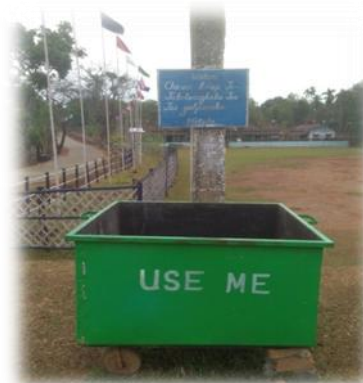
Plate: Dustbins can also be made artistic with and Recyclable modern-day dustbin the simplest form of material.

With the help of mission in 2014 and efforts Public Health Engineering Department (PHED), the villagers began to have pucca toilets. The village has never seen any conflicts; people have learned here to live peacefully and united.