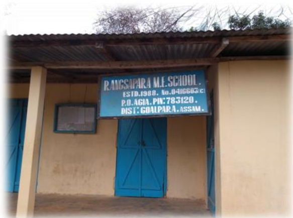
Plate: Rangsapara M.E School

The Education system of this village is very poor. There are only two schools: one is Rangsapara LP School and another is Rangsapara ME School in which children's of the village go for primary education. Only 50% of the population of the village is literate. Only 7% people are Government jobs. 4 Boys and Girls are going outside of the village for the higher study. It seems that less than 20% peoples of the village are uneducated. The people are neither very rich nor are highly educated. And only 20% of population is literate.