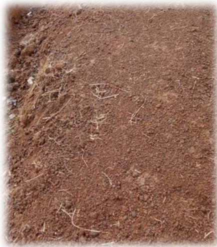
Plate: Soil conditions of Rangsapara Village

The soil of Goalpara district is mainly alluvial, loamy, red, some portion of district also have the soil like black, sandy etc. So the village goalpara also has the soil types like yellow loamy, red soil, alluvial soil etc. mainly red soil found in Rangsapara village.