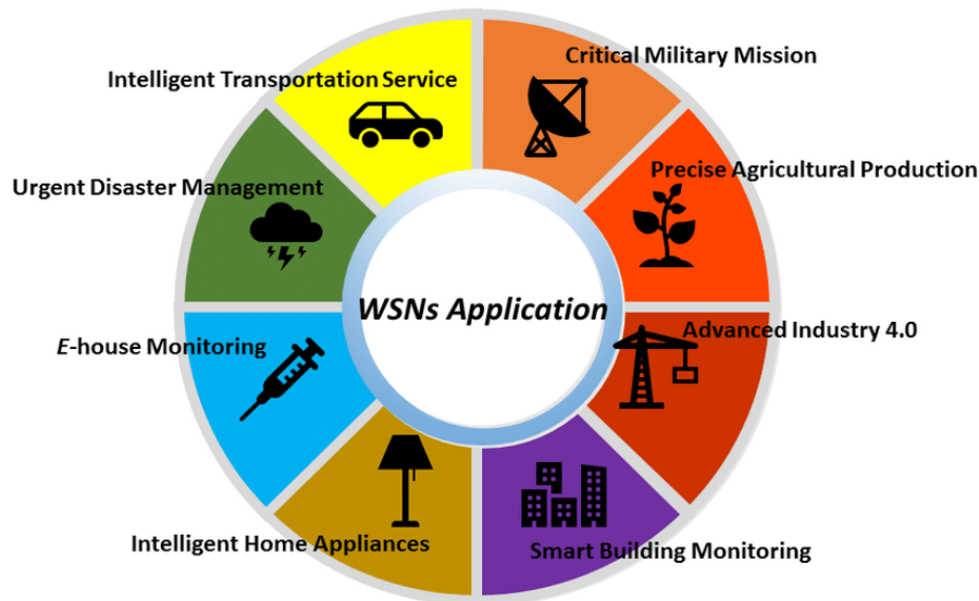
Figure 2. Applications of Wireless Sensor Networks

checking and in many other areas. Some of applications are discussed below: