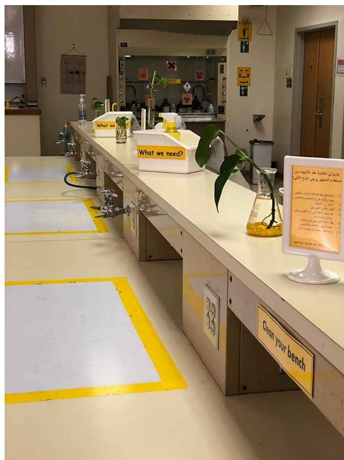
Fig. 3 lab colores

lab which is aesthetically joyful using neutral colored. Research has shown that the environment can have a good effect on the students and staff psychologically, physically, and emotionally. Introducing color into biological labs can improve the aesthetics of a space and may give a portion of creative.