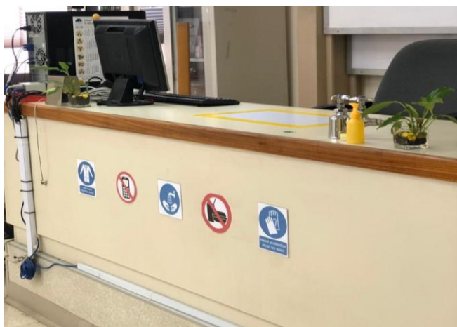
Fig. 2 health and safety sign tools

should also tie back long hair, which can be pulled sometimes in chemicals or Exposed to open flames.