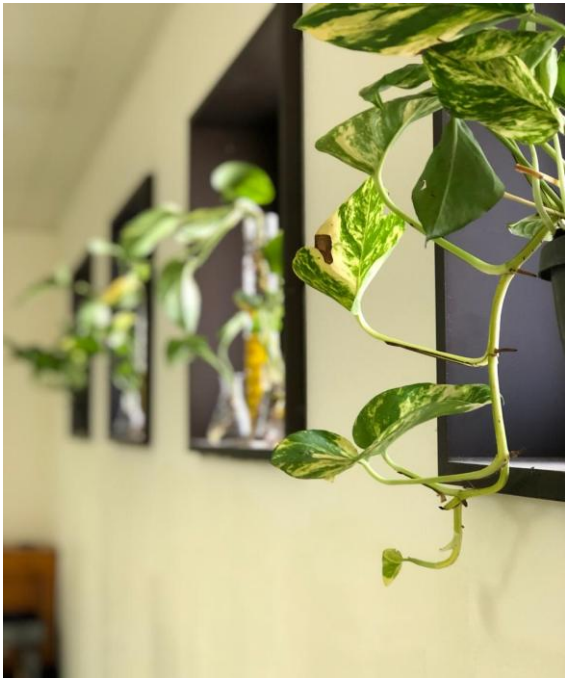
Fig. 4a plants and trees in biological labs