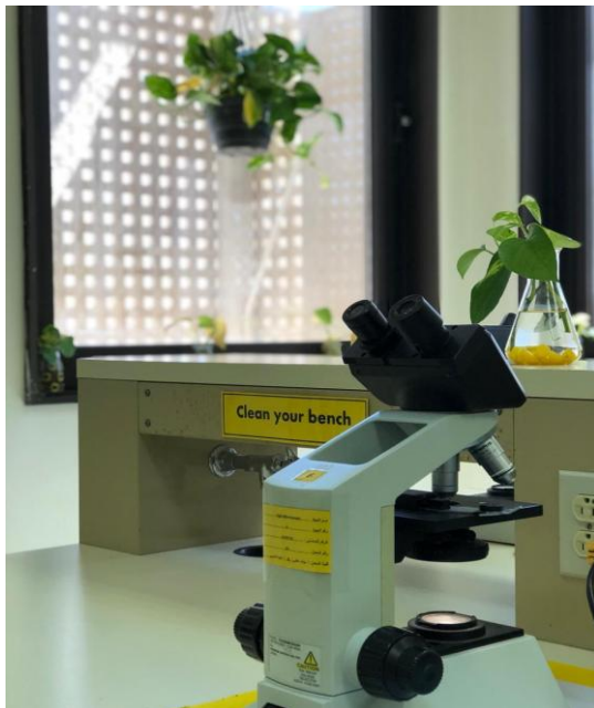
Fig. 4b plants and trees in biological labs