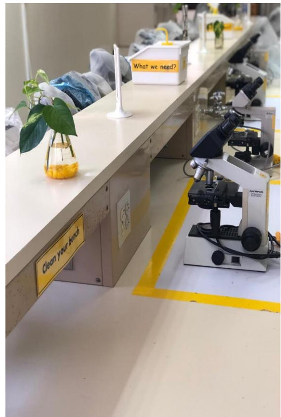
Fig. 4c plants and trees in biological labs