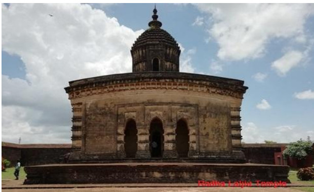
Radha Laljiu Temple

4.5.2. RadhaLaljiu Temple (1658): Malla king BirSingha Dev established this temple in the year of 1658. This temple is head by one sikhara. Traces of the decorative stucco decorations on relievo carving will still be seen on the front. The temple dedicated to Sri ridhika and sri Krishna,