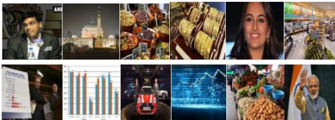
Fig. 1. Big Data

everywhere throughout the world market and a worldwide retreat or lull had seen. Likewise, in 2008 – 09, information about Satyam made a vacuum in the market and little financial specialist's ended it all. Little and moderate access of information turned into a big reason for the big misfortune in the market for little speculators. All information needs to integration fast and give information to the little and medium financial specialists at truly reasonable and moderate expense. Information Traditional database can't most likely handle and incorporate this sort of heterogeneous, fleeting, unstructured and dynamic data put away in better places, so another design is required for the integration of the heterogeneous database. The data can't be accessible at one spot or one database and it is in the diverse arrangement. It requires an incorporated system which gives every worldly datum in one spot and easy to process for the basic leadership process in wanted configuration. Look at data and its organizations are given in Fig. 1.