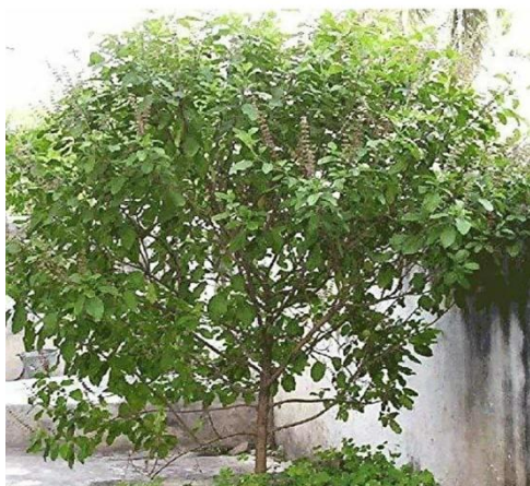
Fig.1 Ram Tulsi.

Kingdom : Plantae Subkingdom : Tracheobionta