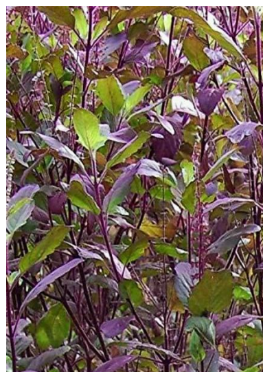
Fig.2 Krishna Tulsi.

The botanical name of Tulsi is Ocimum sanctum , it is found quite commonly all over the Indian sub continent. The plant can grow in the wild in the tropical and subtropical regions. It prefers fairly to high rainfall areas with high humid conditions. Long day and high temperature conditions enhance growth. The plant's height varies from 3 to 5 feet. Tulsi crop is planted in the month of April and May and it can be sown with two methods of seeds and plants. There is need for about 12 kg of seeds to cultivate it in one hectare. The flowering season is winter (December to February).