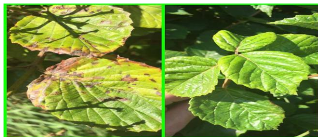
Fig: 1 Leaf Diseases

A plant disease is any abnormal condition that alters the appearance or function of a plant. A plant disease takes place when an organism infects a plant and disrupts its normal growth habits. Symptoms can range from slight discoloration to death. Diseases have many causes including fungi, bacteria, viruses, and nematodes. Below are 10 of the most common diseases affecting ornamental trees and shrubs: