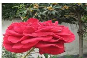
Fig 1: Example of Fused Image

In Fig1, each image (1) (2) has back side blurred part and front side blurred part respectively due to bad focus. Image (3) is the result of combining the three other images using image fusion technology. This example could be used in a commercial advertisement photo shot.