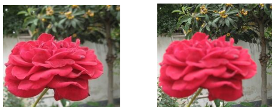
1) Back side blurred Image 2) front side blurred image

The technique of blending two images or more than two images which produces outcome as the composite fused image. The obtained fused image is the upgraded version of original images because it has all the salient information. The present applications makes majority usage of this fused image to speed up their processing tasks in their respective fields. Recent real-time applications which require image fusion are remote sensing applications, medical applications, surveillance application and photography applications [13]. The following figures show how image fusion can be applied to several areas.