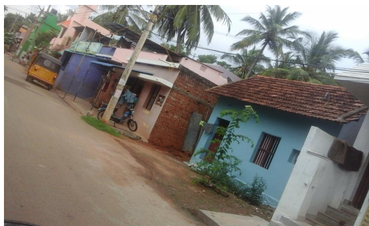
Photo No.3. Vadassery Weavers' Housing Colony in Nagercoil in Kanyakumari