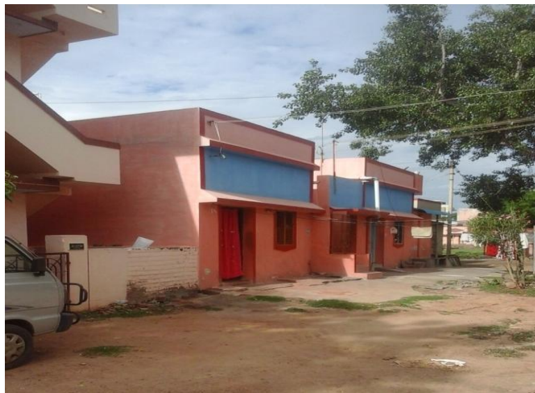
Photo No. 5 Maintained and Modified Houses in Thiruvalluvar Housing Colony in Madurai