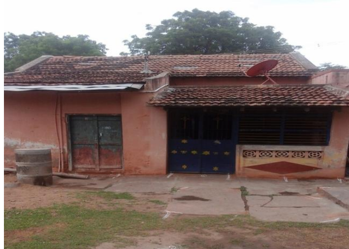
Photo No.1 A House in Krishnapuram Weavers' Housing Colony in Madurai

handloom industry some weavers' found it difficult to run their family and to raise their standard of living. Some handloom weavers have changed into working in power looms. In Aruppukkottai Weavers' Colony all the handlooms were changed to power looms, because through the handloom they could earn a maximum of Rs. 250 but through working in the power loom they earn Rs. 600 per day. iii The street lights and the drainage systems are not maintained properly. In some places the houses are maintained and modified with double storied building.