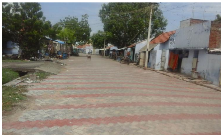
Photo No. 2. Prasanna Venkatesa Perumal Weavers' Housing Colony in Madurai