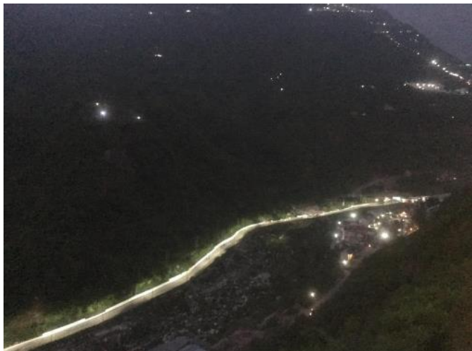
Plate:3 The beautiful picture of upstairs shining road of the Holy Shrine of Shri Mata Vaishno Devi Ji which is considered to be one of the holiest pilgrimages of our times and is located in the folds of the three peaked mountain named Trikuta (pronounced as Trikoot).