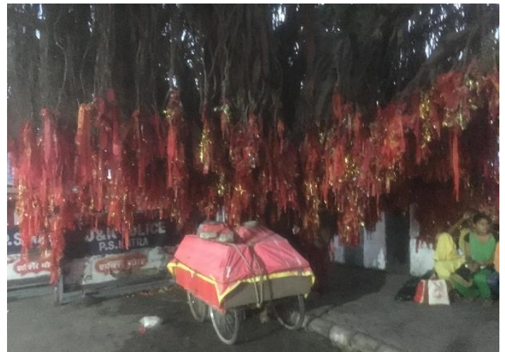
Plate:5 The beautiful red cloured picture of different types laces which are tied on the Holy tree of the temple as part of the adoration of the pilgrimage.