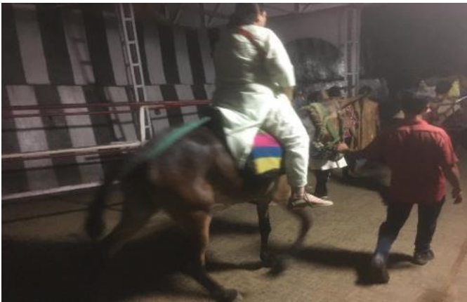
Plate:10 The image of a horse rider who is riding on a horse for travelling to the temple of Vaishnavo Devi temple.