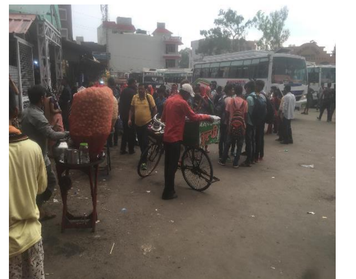
Plate:7 The picture of the street market of the adjacent road of Vaishno Devi Temple with the pictures of some buses.