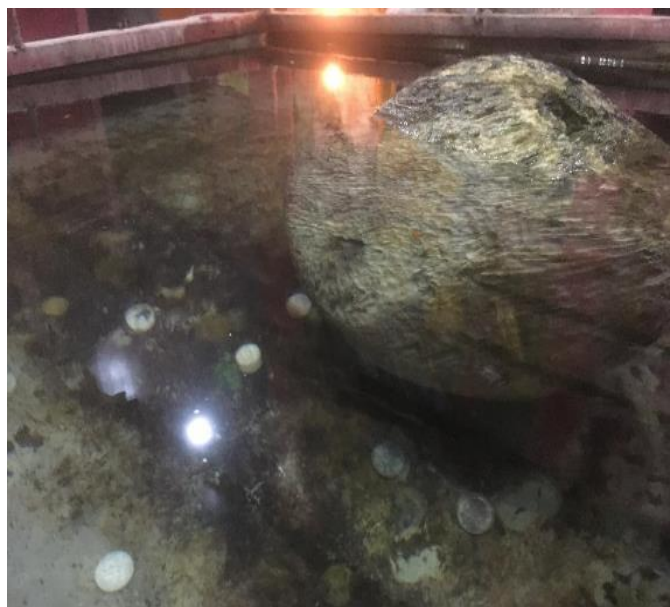
Plate:1 The picture of the Holy rock of the Vaishnavi Devi temple which carries the signs of legendary and mythological history of India.

On the other side, the presence of different types of the Holy Bhawan, is the main centre of reverence for the devotees. It becomes also the key location of the attracted place in the entire Yatra circuit. And the adequate arrangements and facilities of these Bhabans have been created by the Shrine Board for the convenience of the devotees for the visitors. All the features of the Holy Vaishnavi Devi Temple like free & rented accommodation; Toilet Blocks; Bhojanalayas; Post Office; Banks; Communication (STD/PCO); Announcement Centres; Blanket Stores; Cloak Rooms; Medical Dispensary (with a ICU); General Stores; Bhaint Shops; Police Station, etc. make the place unique for its own importance. So, it now becomes desirable place for the person one who wants to visit the Holy Vaishnavi Devi temple of Jammu and Kashmir in India.