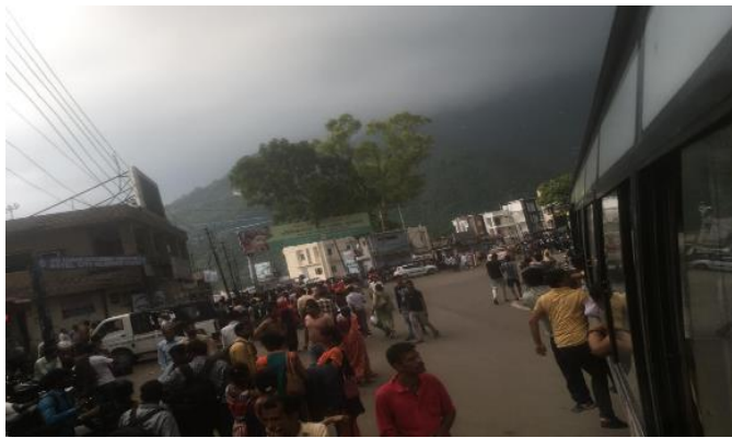
Plate:9 The beautiful picture of the street of the road which leads to the Holy temple of Vaishnavo Devi.