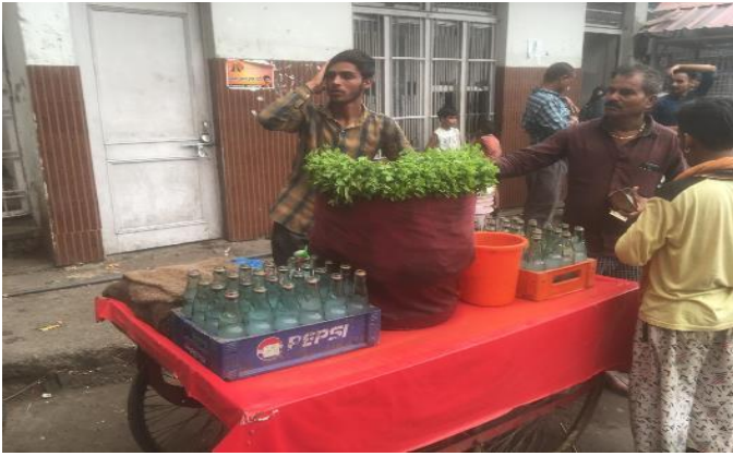
Plate:8 The picture of a small trader who is dealing the watery juice with the leaves and ices and cold drinks.