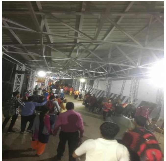
Plate:12 The circulated passage of the temple Vaishnavo Devi for going and coming along the road which is covered with proper shade and lighted with proper shining of lamps.