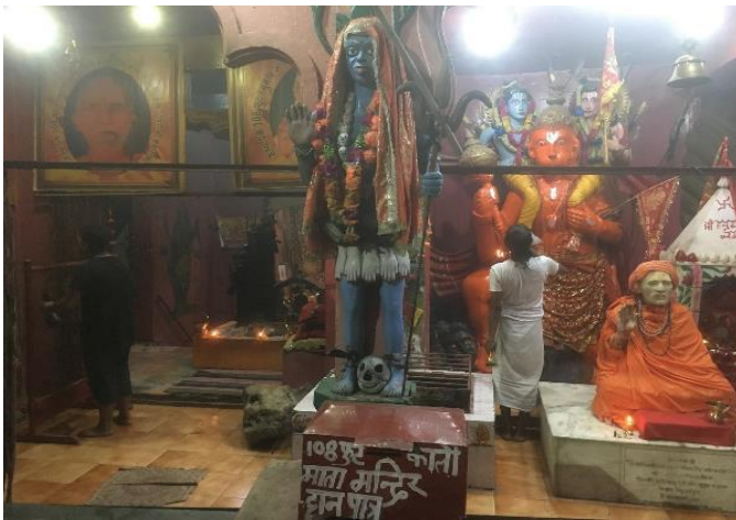
Plate:2 The beautiful image of the Holy Pindi of Mata Maha Kali (the Supreme Energy of Dissolution) in the colour associated with Her i.e. black which provides the devotees the Supreme Energy of dissolution.