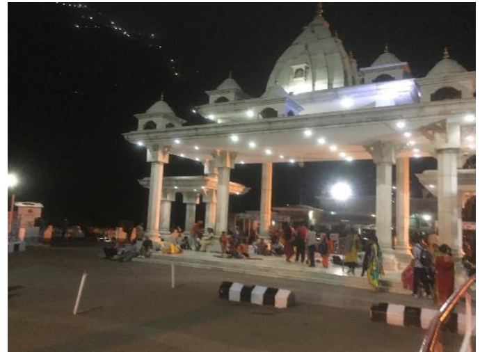
Plate:13 The nice picture of the outer part of the temple within a inside of the temple Vaishnavo Devi which is white in colour and different types of attractive designs.