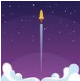
Logo of Memrise

Memrise helps the learners to increase English vocabulary in a systematic way. One can easily download this app in any android based instruments and can easily access this app in an effective way. One of the noticeable merits of this app is that it can also be used on offline mode. Once, this app is downloaded in any android based instrument, one can use this app for life time. There is no need of internet after downloading this app. Thus, a learner can easily download this app from the play store of their instruments. At the time of downloading this app, one must have internet connectivity in their instruments, for further of frequent use of this app, there is no need of internet connectivity. Memrise also have courses to learn the English Grammar in an innovative way.