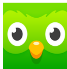
Logo of Duolingo

This application is one of the highly recommended and easiest for the new English learners or beginners. This is one of the gamified learning systems for the beginners. One can easily